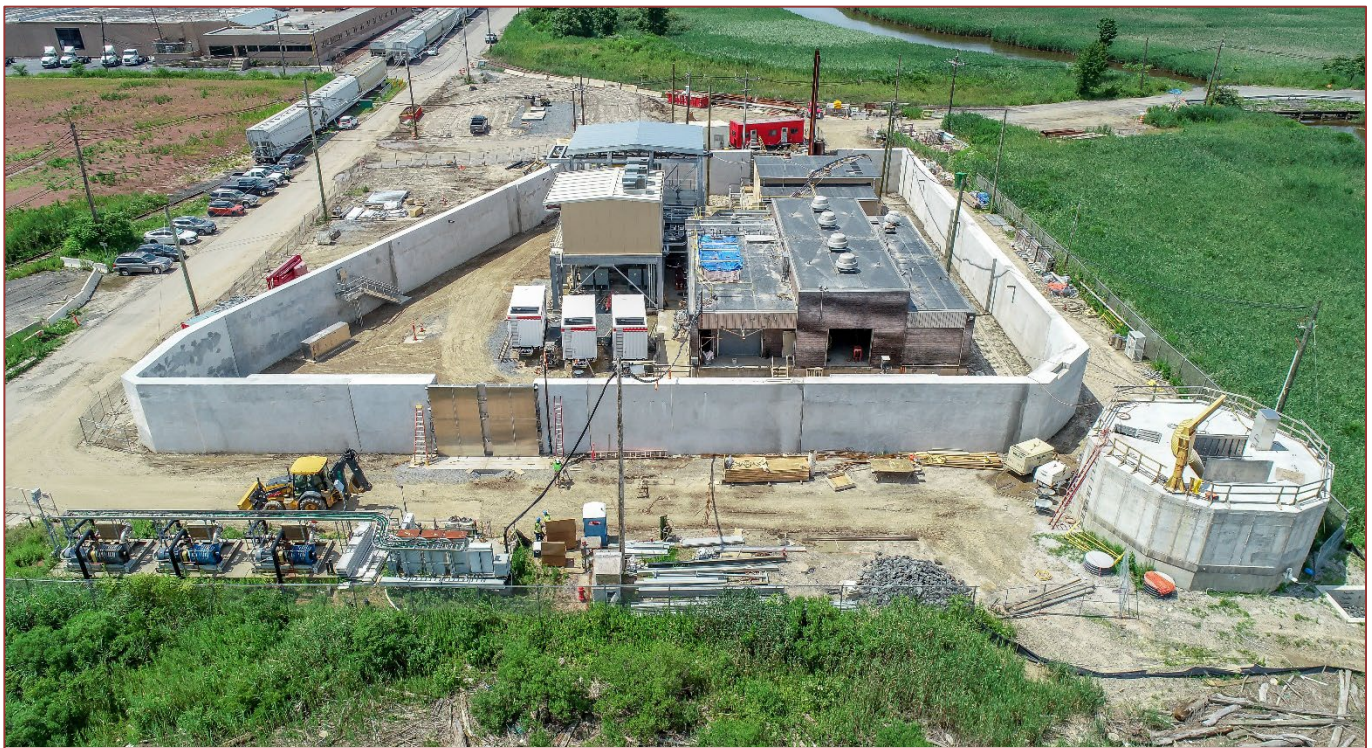
Restoration and Flood Mitigation

The I-Bank will employ its State aid intercept powers to intercept funds of any borrower that has defaulted on its I-Bank obligation. Intercepted funds will be applied to make up any repayment deficiencies to the I-Bank. Further, the I-Bank may take other actions to cause the LGU to repay in a timely manner any sums in default pursuant to the terms of the LGU's loan agreement.